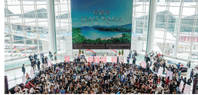
Cheung Kong Property, a Hong Kong based diversified property company, was a new position in the guarter.

SKAGEN m2 is now more concentrated than ever, consisting of 32 holdings, of which all our conviction cases have higher weighting.