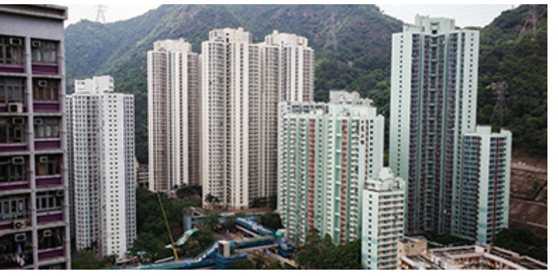
Singapore and Hong Kong were the best performing Asian real estate markets in the quarter.

Some of the biggest losers in the second quarter were IRSA, Ashford Hospitality Trust and SL Green. Argentinian IRSA was the biggest detractor, but more on external factors than company specifics. IRSA has been a strong performer over the past twelve months, but the profits were taken off the table when MSCI delayed its decision to reclassify Argentina as an emerging market. IRSA also announced an equity issue during the period, which was fairly well received by the market. Ashford Hospitality Trust is another of the worst performers this year and has continued to suffer due to a failed and irresponsible bid for Felcore, as well as a slower hospitality market in US. However, both Ashford and SL Green made only very small losses in the quarter.