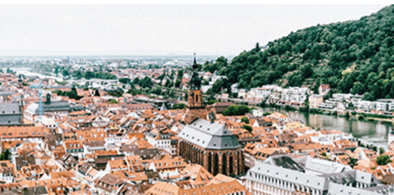
SKAGEN m2 added a new position, German Aroundtown, which is the largest listed German commercial operator.

The largest detractor in the quarter was Argentinian IRSA after strong performance last year. This was despite a report in line with expectations, some positive news about land plot acquisition and a share buyback program from its parent company. Despite a decent report, the Norwegian retail operator Olav Thon was a poor performer in the quarter due to general pressure on the Norwegian real estate sector and retail segment.