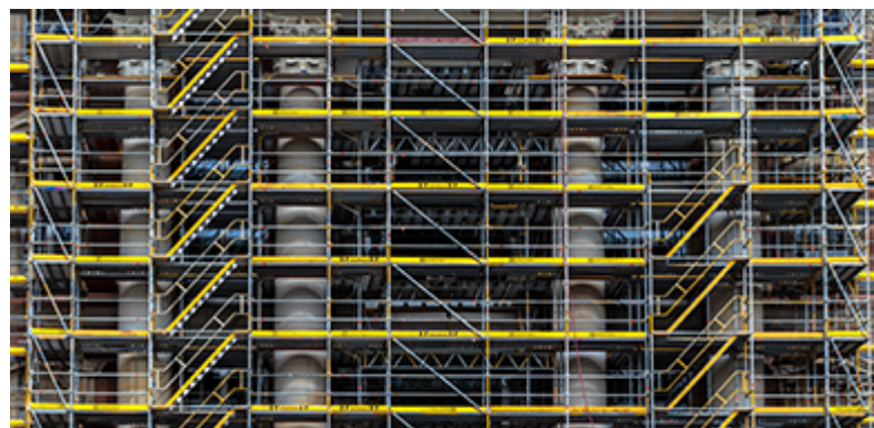
The best contributor during the period was Spanish commercial operator Inmobiliaria Colonial.

At the same time as entering this position, we sold out of German office operator DIC Real Estate at very good levels. During the quarter, we also exited the Austrian residential operator Buwog after a bid from German residential operator Vonovia.