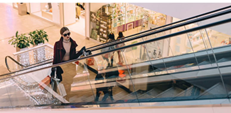
The Indian mall operator Phoenix Mills continued to perform well.

One new holding during the period was Norwegian Self Storage Group, present in Scandinavia with an untapped potential for this segment. The market is lagging in terms of storage space per capita and user behaviour. The segment is primarily driven by life changing events, but also the trend towards smaller living space and urbanisation. Self-storage generally has resilient characteristics over the business cycle. Another new holding was the Hong Kong based, but geographically diverse, Far East Consortium. The business includes investment properties, mainly hotels, and development. It is trading at a deep discount.