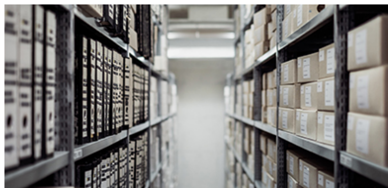
New holding: Norwegian Self Storage Group. The market is lagging in terms of storage space per capita and user behaviour.

The global stock markets have been in climbing mode for many years, although with big differences in return. Looking at the global real estate markets, the general conditions for real estate continue to be very favourable with low interest rates and expanding economies synchronised globally. High demand in certain cities and segments will continue to drive rents and capital values even though yield compression has slowed in most places, putting the brakes on increases in prices and capital returns from yield compression. SKAGEN m2 maintains its philosophy of investing in companies with embedded growth less affected by yield movements. There is still good rent reversion potential in many companies, meaning the spread between the companies' current rent-roll and market rents. High demand and low vacancies will likely continue to drive earnings and cash flow this year, and visibility is unique in the sector due to leasing and credit maturities. Balance sheets are solid, credits diversified and refinanced at low levels with long duration. The spread between valuations in direct and listed real estate are still wide, implying that we will see further M&A transactions on the stock exchange especially in the mall industry.