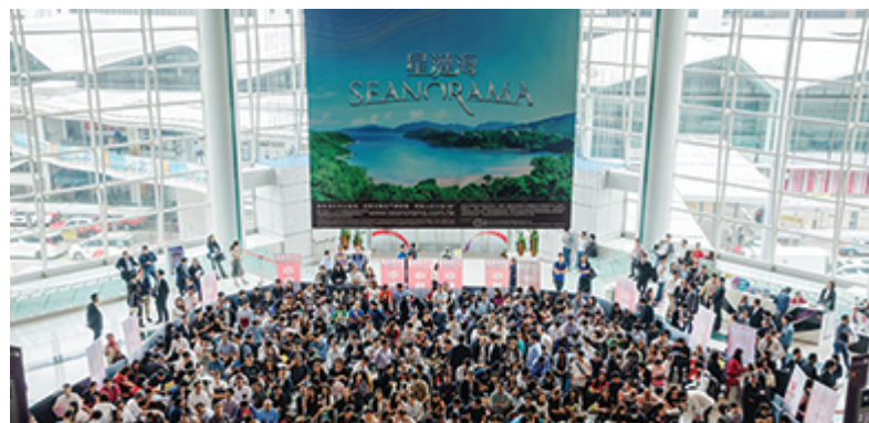
Cheung Kong Property, a Hong Kong based diversified property company, was a new position in the quarter.