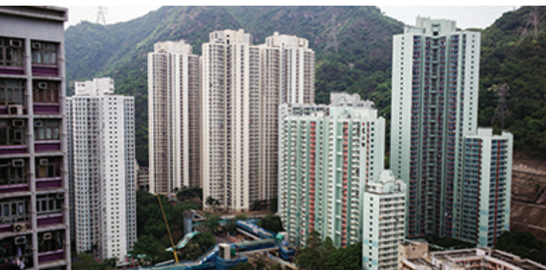
Singapore and Hong Kong were the best performing Asian real estate markets in the quarter.

Some of the biggest losers in the second quarter were IRSA, Ashford Hospitality Trust and SL Green. Argentinian IRSA was the biggest detractor, but more on external factors than company specifics. IRSA has been a strong performer over the past twelve months, but the profits were taken off the table when MSCI delayed its decision to reclassify Argentina as an emerging market. IRSA also announced an equity issue during the period, which was fairly well received by the market. Ashford Hospitality Trust is another of the worst performers this year and has continued to suffer due to a failed and irresponsible bid for Felcore, as well as a slower hospitality market in US. However, both Ashford and SL Green made only very small losses in the quarter.